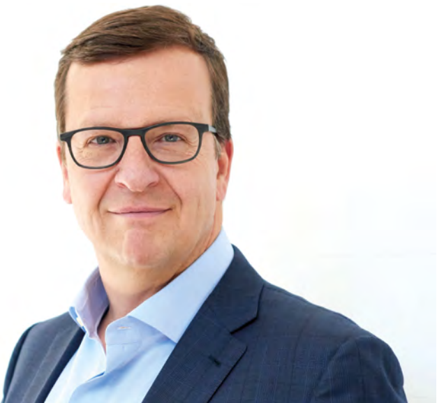
Eddy Pirard, PRESIDENT, THE JTI FOUNDATION

I am delighted to introduce our first biennial report on the work undertaken by The JTI Foundation to support disaster management programs around the world. There is still much work to do to proactively tackle, not only the effects, but also the causes of manmade and natural disasters. However, it is also important to take a step back to look at the difference that we are able to make as a charitable foundation.