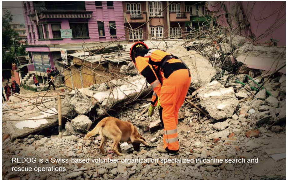
REDOG is a Swiss-based volunteer organization specialized in canine search and rescue operations

Believing that the work of its disaster relief partners would improve through closer cooperation, the JTI Foundation in June 2013 convened a workshop in Istanbul. This brought together partners GEA, REDOG, PWJ and ShelterBox to explore areas for potential collaboration.