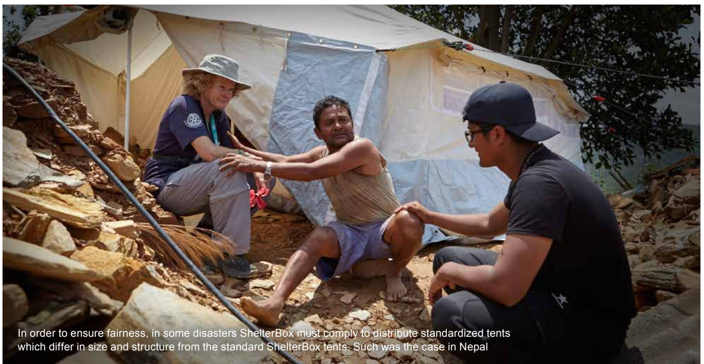
In order to ensure fairness, in some disasters ShelterBox must comply to distribute standardized tents which differ in size and structure from the standard ShelterBox tents. Such was the case in Nepal

As part of the JTI Foundation’s strategy of helping those vulnerable to disasters to build resilience, is also assessing with Habitat for Humanity International, the possibility to implement a long-term recovery program in the country.