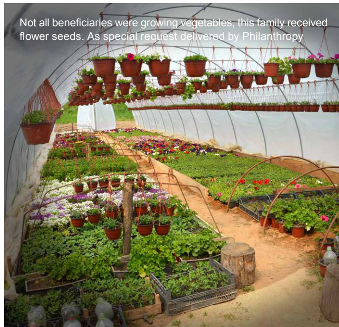
Not all beneficiaries were growing vegetables, this family received flower seeds. As special request delivered by Philanthropy