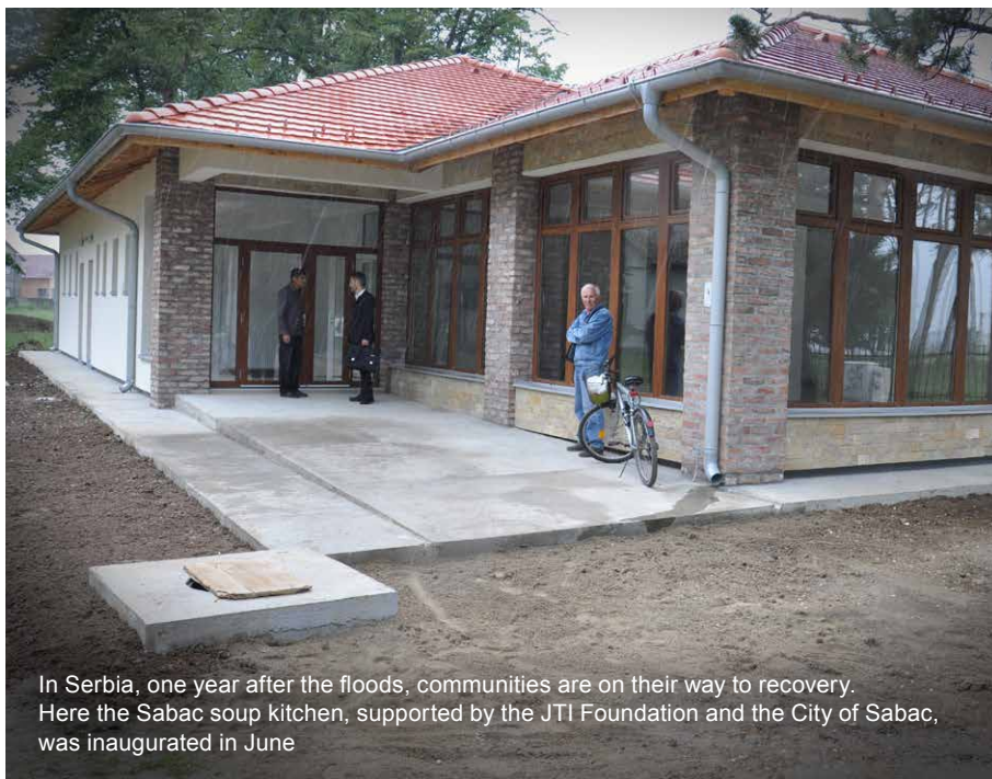
In Serbia, one year after the floods, communities are on their way to recovery. Here the Sabac soup kitchen, supported by the JTI Foundation and the City of Sabac, was inaugurated in June