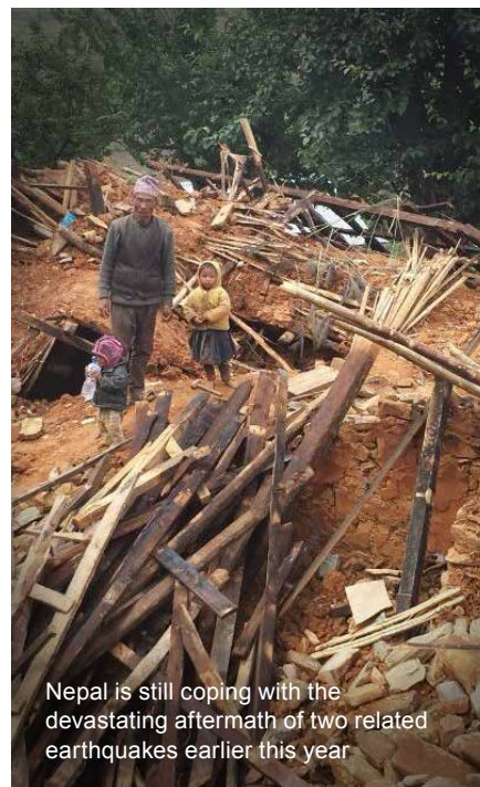
Nepal is still coping with the devastating aftermath of two related earthquakes earlier this year