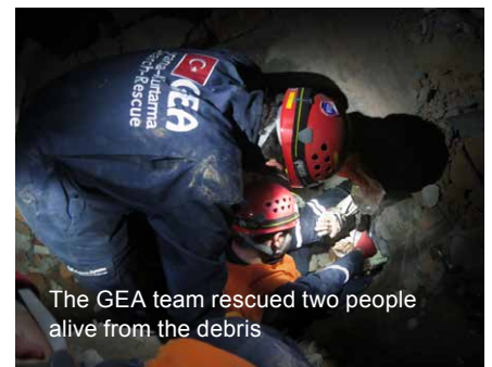
The GEA team rescued two people alive from the debris

As a result, REDOG and GEA signed a protocol for joint deployment – which has helped both organizations achieve greater effectiveness on the ground in Nepal by combining their rescue efforts.