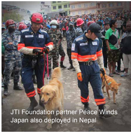
JTI Foundation partner Peace Winds Japan also deployed in Nepal

Shortly after, the Swiss Rescue Dog Association, REDOG, and Peace Winds Japan (PWJ) – both JTI Foundation’s long-term partners – also arrived to begin Search & Rescue missions.