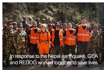
In response to the Nepal earthquake, GEA and REDOG worked together to save lives

In response to the first quake, four of the JTI Foundation's partners immediately deployed to the shattered country. GEA, an organization of Turkish volunteer Search & Rescue (SAR) specialists, was one of the first international teams in Nepal – arriving in Kathmandu at 11 am local time the day after the quake. On arrival, the team was welcomed by the Nepalese Army, and working in coordination with the military, immediately commenced search missions in Sitapaila, an area of the capital badly damaged in the disaster.