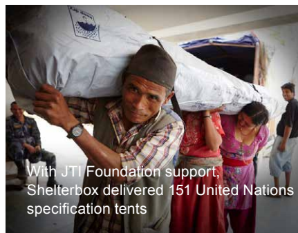
With JTI Foundation support, Shelterbox delivered 151 United Nations specification tents